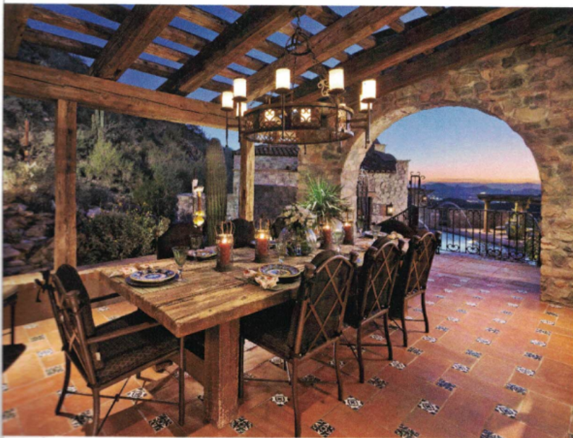
There are many antique materials and finishes present in the construction of this patio and its adjoining home. Reclaimed timbers, antique tiles and doors and natural stone harvested from the site were used throughout.